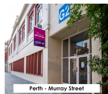
Perth - Murray Street